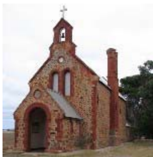
St Matthew's Poonindie