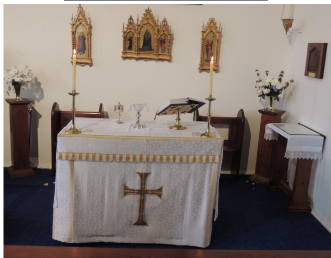
HERE AND NOW