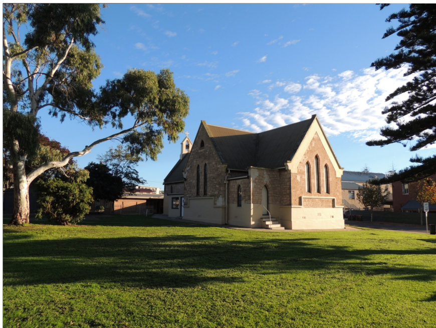
ST THOMAS' NEW LOOK WITH THE OLD FENCE REMOVED