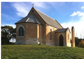
St Matthias' Wangary