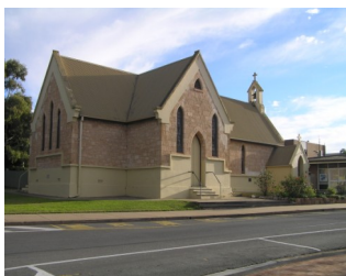
St Thomas' Port Lincoln

This Newsletter comes to you from the Anglican Parish of Port Lincoln in the Diocese of Willochra